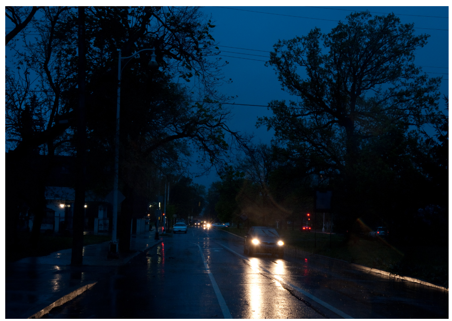
Southwest Detroit residents overwhlmingly identified their neighborhood's broken streetlights as their biggest concern. This is West Grand Boulevard in 2014.