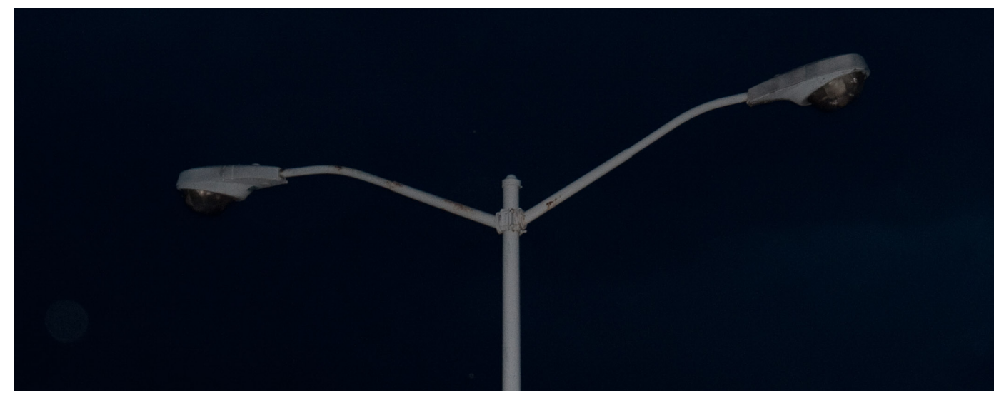
One of a series of photographs published by Detroit143 to document the total darkness that descended on Southwest Detroit when the public lighting failed.

THERE IS INTERESTING MIDDLE GROUND to be explored between traditional media approaches of letthe-chips-fall-where-they-may reporting and advocacy journalism. For the sake of discussion, let's call it "consequential journalism," an evidencebased approach aimed at provoking specific civic improvements.