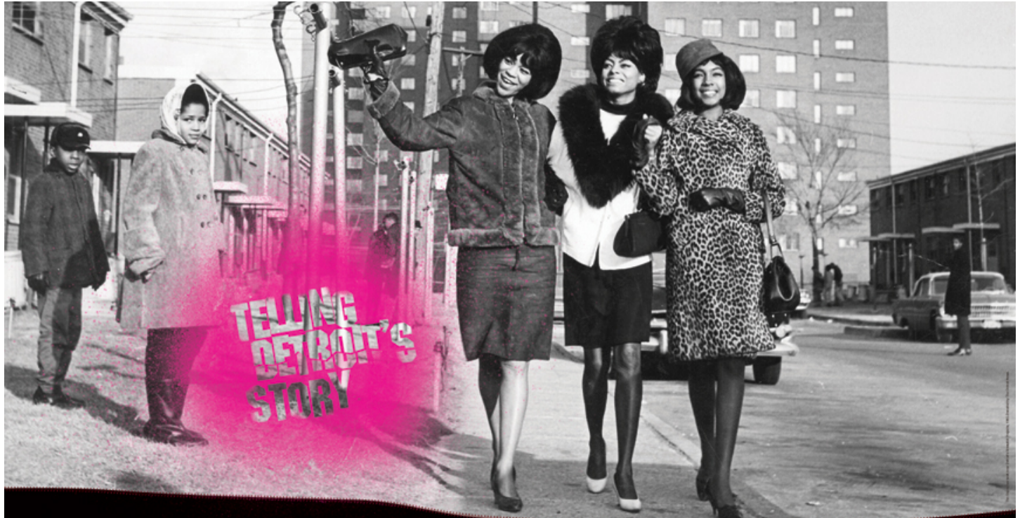
One of the four posters created to promote the "Taking Charge of Our Story" event at Wayne State University in 2010.

In October, 2015, rough calculations based on the café's rudimentary bookkeeping showed good progress driven by our marketing programs. Despite the extremely harsh winter weather of 2014-15, average monthly revenue from January 1 through September 5, 2015 was 58.82% higher than in 2014. The business had gone from a small loss in 2014 to a projected operating profit (based on the run-rate for the first 244 days of the year) of just under $40,000. The cash that the owners were able to realize from the business had roughly doubled. In addition, after using a local grant to buy a coffee roaster, Jordi and Melissa were able to make a deal with a coffee grower in rural Mexico to buy the complete output of his fields. So the marketing investment in Detroit had not only grown a neighborhood café, it had also benefitted another small business in Mexico.