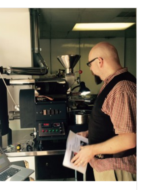
TING BEGINS AT CAFE CON