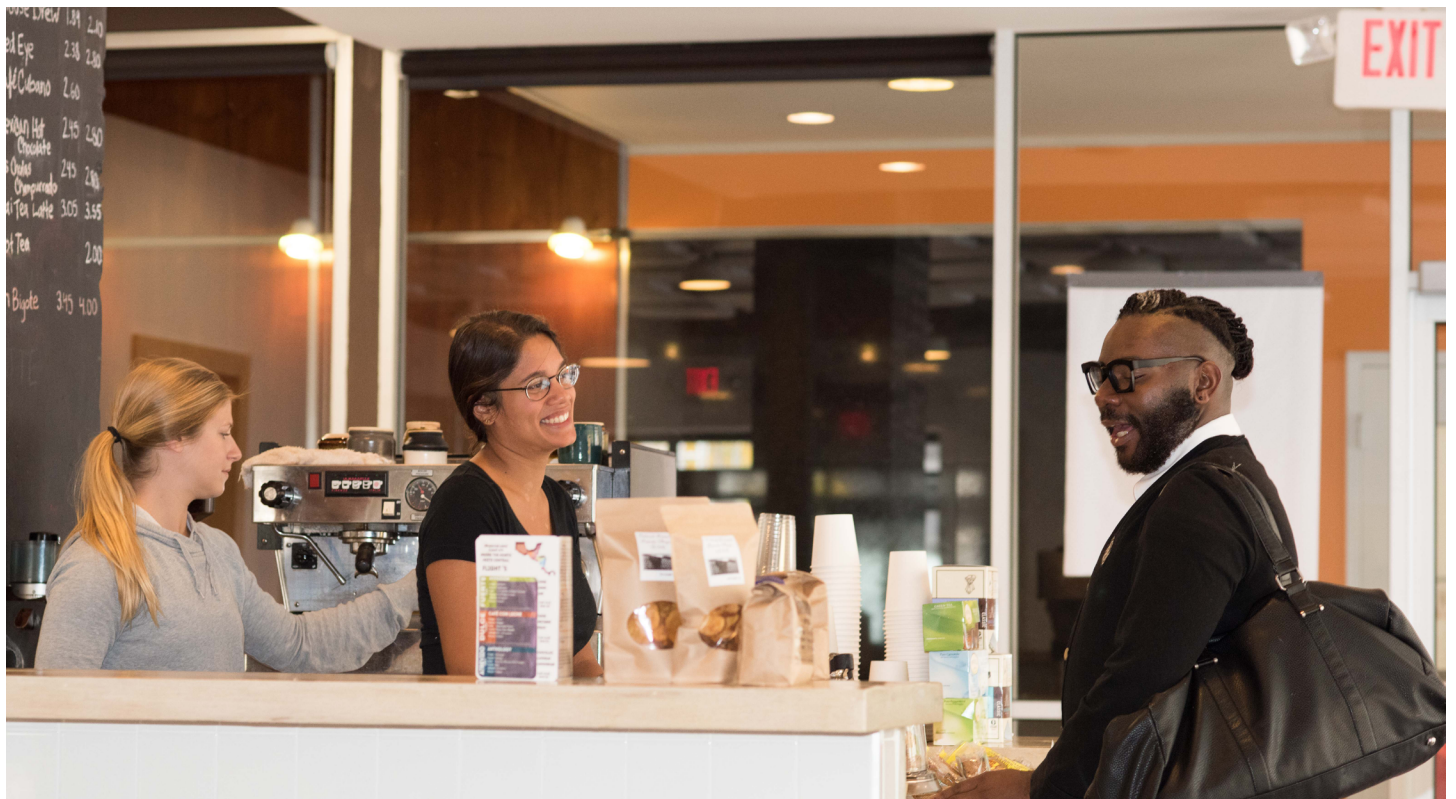
The new location in the New Center — Café con Leche Nord — is becoming a community center just like the original café on W. Vernor Highway.

to successful strategies that differentiated us from journalism as usual.