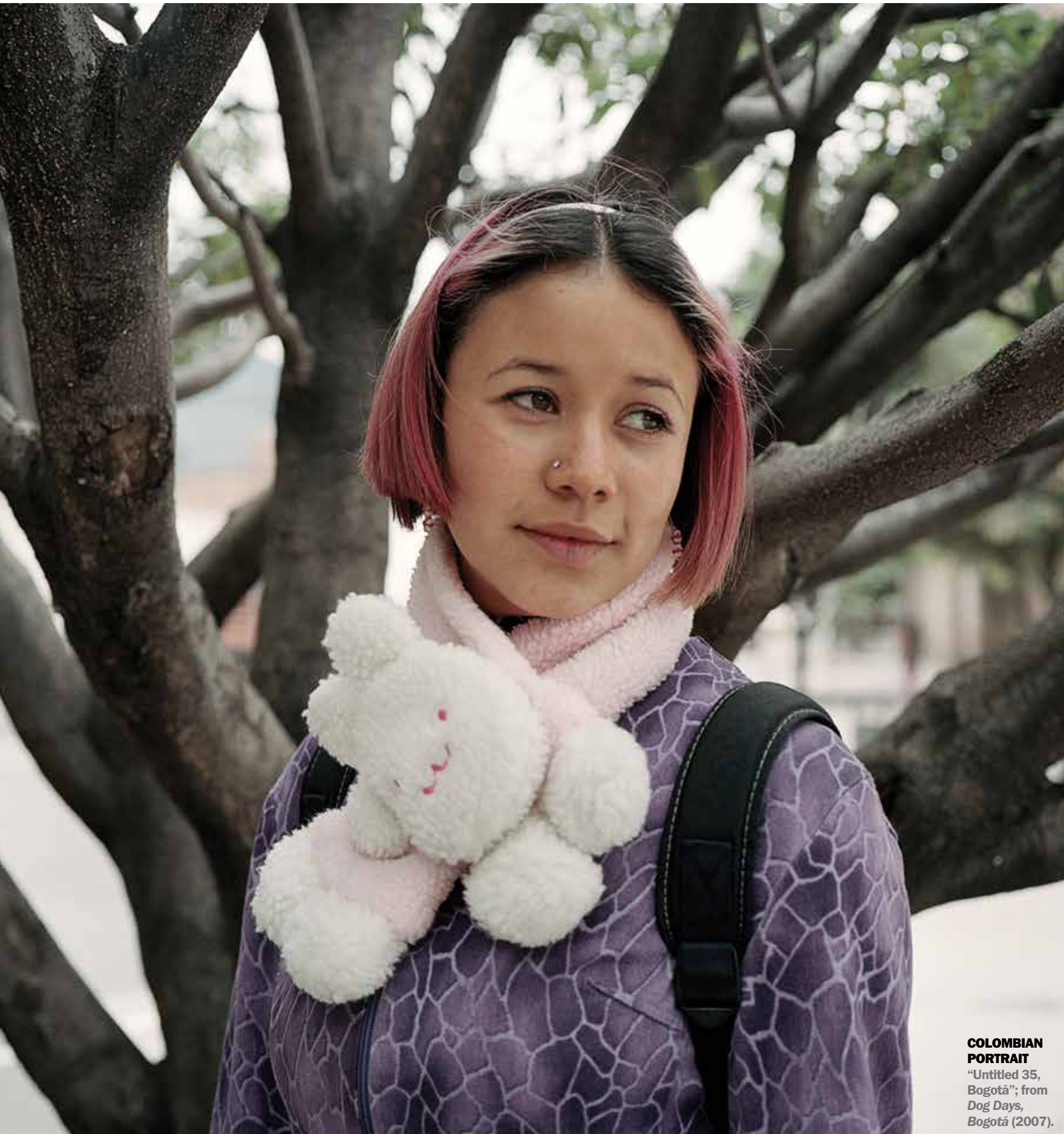
COLOMBIAN PORTRAIT “Untitled 35, Bogotá”; from Dog Days, Bogotá (2007).