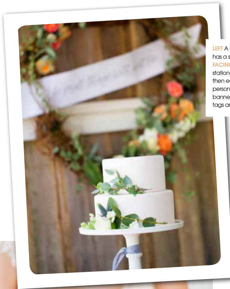
LEFT A plainly decorated cake has a simple old-world charm. FACING PAGE Beautify your stationery suite with calligraphy, then echo the sentiment by personalising table runners and banners, plus menu cards, favour tags and dessert bar labels.