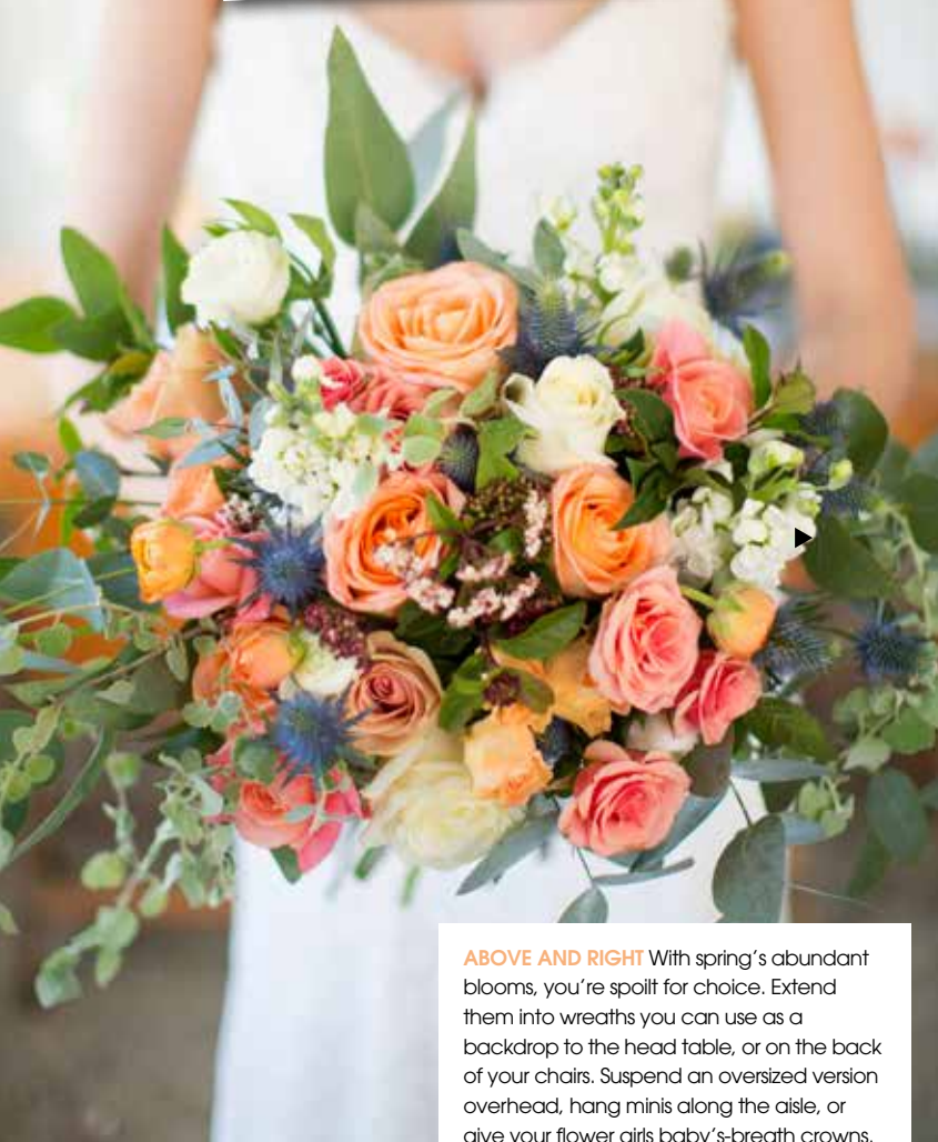
ABOVE AND RIGHT With spring's abundant blooms, you're spoilt for choice. Extend them into wreaths you can use as a backdrop to the head table, or on the back of your chairs. Suspend an oversized version overhead, hang minis along the aisle, or give your flower girls baby's-breath crowns.