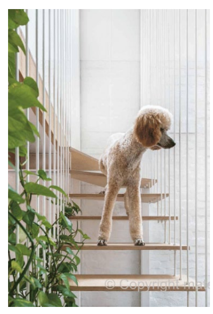
Words: Philippa Prentice.