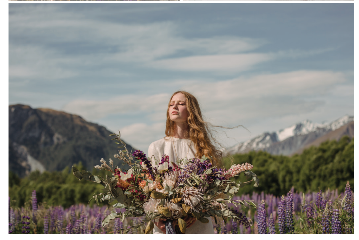
Hair & makeup—Olivia Wild Beauty wildonmakeup.com, @oliviawild_beauty