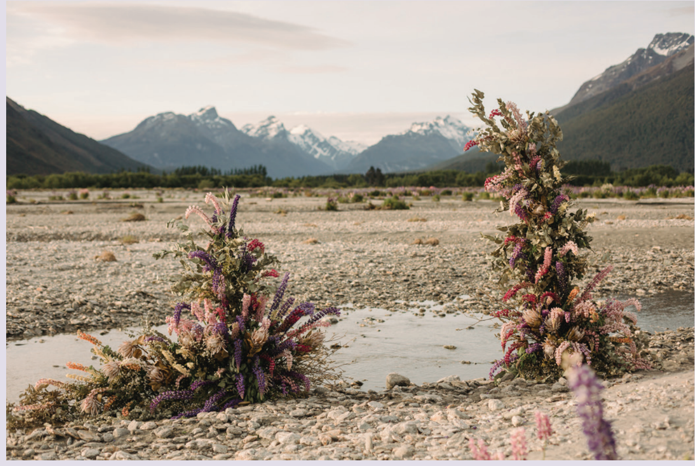
Flowers—Gypsy West at The Vase Flora & Foliage thevase.net.nz, @thevasequeenstown