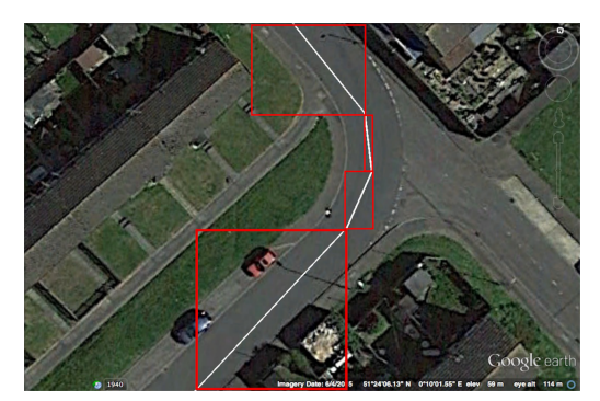
Figure 5: Route Exclusion problem.

the knowledge of which road a given segment is on to validate the fact that two segments are indeed on the same road.