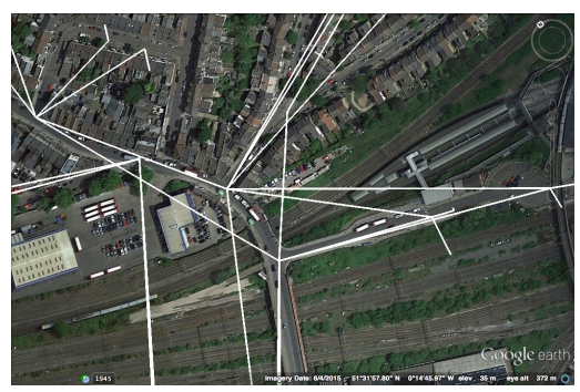
Figure 2: The original dataset contains bus stop locations only, which is not sufficient for running a route selection algorithm.

direction API is visualized on Fig. 2 and Fig. 3: