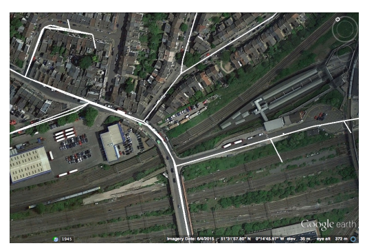
Figure 3: The processed dataset contains a more detailed route information obtained through turn-by-turn direction API

direction API is visualized on Fig. 2 and Fig. 3: