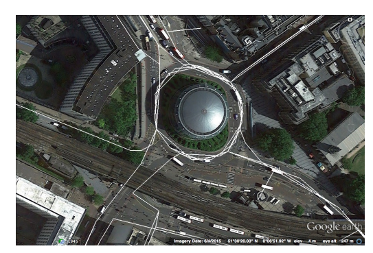
Figure 4: Charlie Chaplin Walk roundabout.