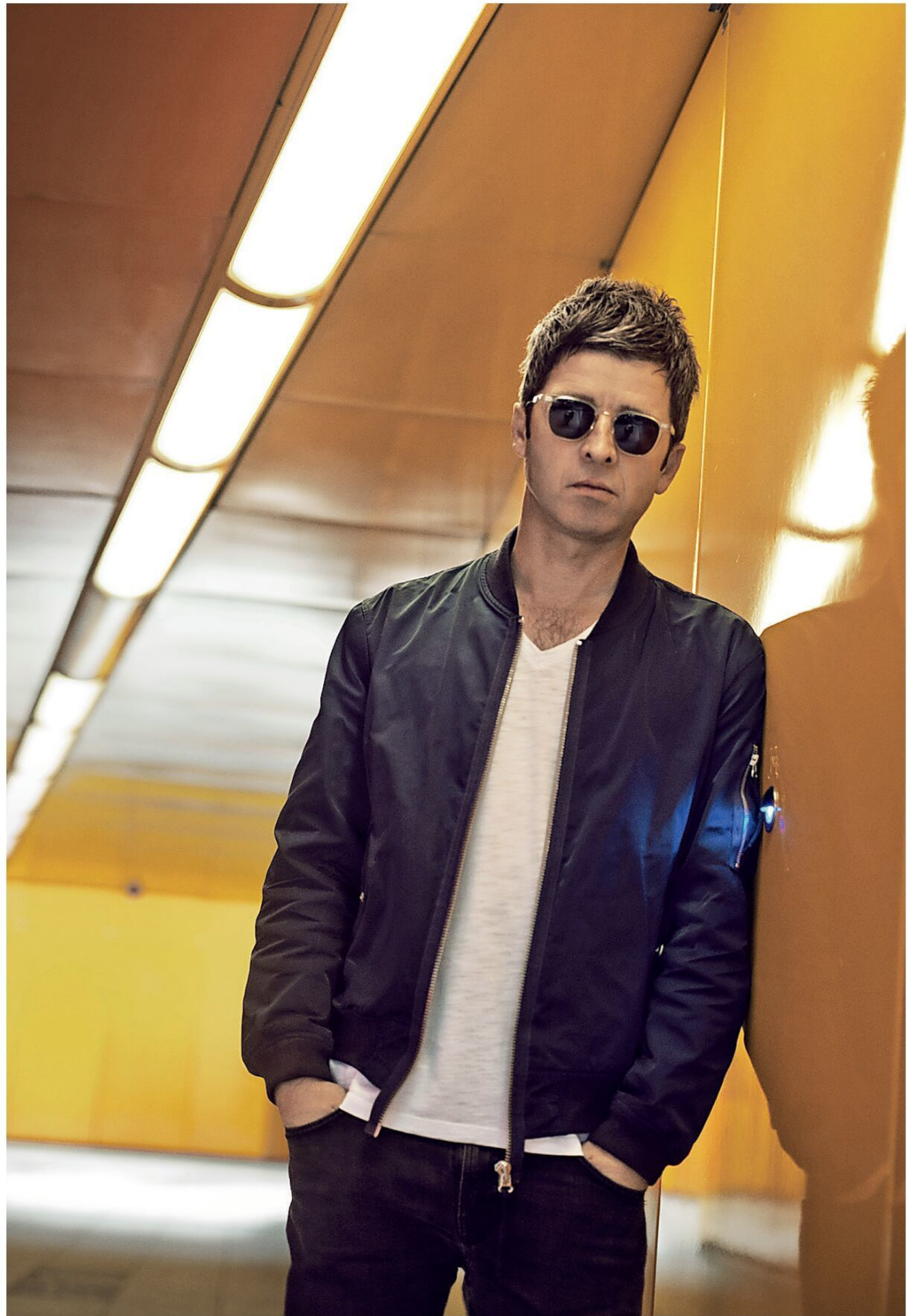
Noel Gallagher is one of the many high profile musicians to have featured on the podcast