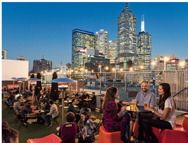
ROOFTOP BAR AT CURTIN HOUSE