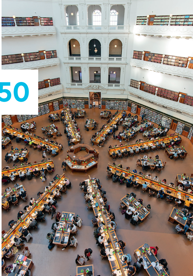
THE LA TROBE READING ROOM AT THE STATE LIBRARY