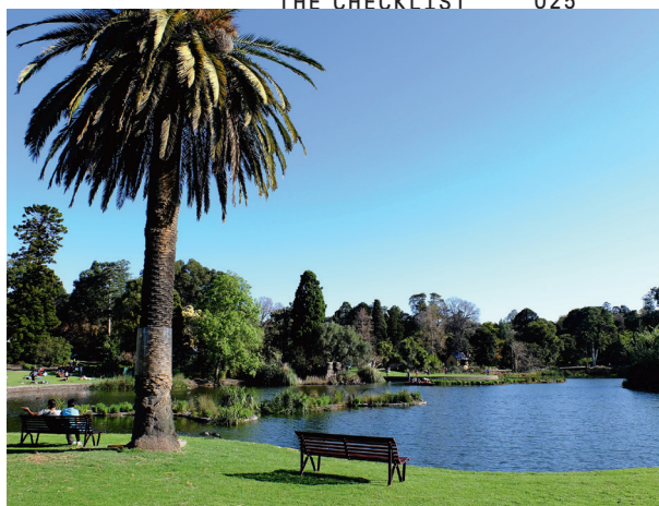
ROYAL BOTANIC GARDENS

> Time for a quick pit stop on the way to dinner. A day in Melbourne just isn't complete without some fudge from The Beechworth Sweet Company, which you'll find in the absolutely gorgeous Block Arcade. About $2.50 will get you 50 grams of the good stuff. beechworthsweetco.com.au