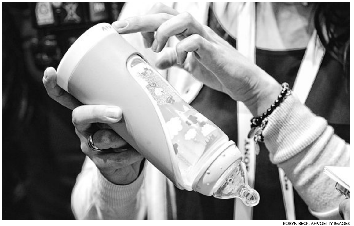
Slow Control smart bottle gives feedback on how to hold it to keep babies from swallowing air.

USA TODAY 2D MONEY THURSDAY, JANUARY 8, 201