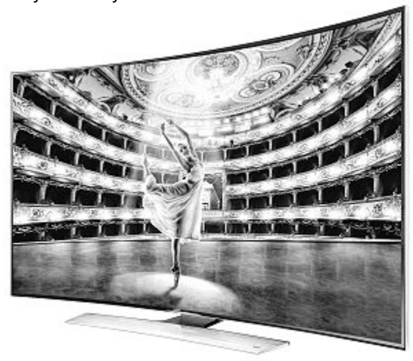
Curved: Curved TVs first appeared in 2014 as a new take on the traditional flat-panel design. The curve of the screen is meant to simulate the curve of a larger movie screen, such as in an IMAX theater. Curved TVs are otherwise no different from flat ones.