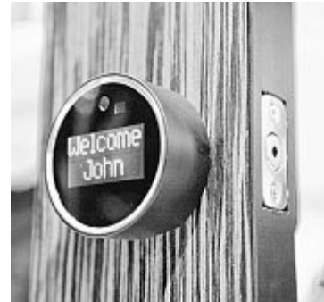
The Goii smart lock sends real-time picture alerts via text or e-mail of the person who is entering your home.

We saw it in start-ups like Sevenhugs — which offers a sleep tracking and environmental monitoring system for the whole family — and Edyn, a smart garden monitor that keeps track of plant hydration and soil nutri-