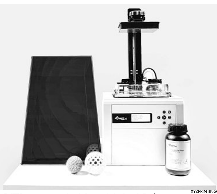
XYZPrinting da Vinci Nobel 1.0

The da Vinci Nobel 1.0 from XYZPrinting is a new SLA (Stereolithography Apparatus) 3-D printer that uses UV technology to quickly harden liquid resin, creating finer detail than most consumer models. Better still, the Nobel 1.0 will cost just $1,499 — extremely reasonable compared to other, far more expensive SLA printers.