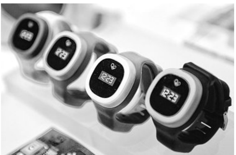
Children's watches by HereO are equipped with GPS.

Child Angel's lightweight, water-resistant wristband will alert parents if it's removed, or if their size of a USB stick. It fits snugly kids leave a designated, customiz-