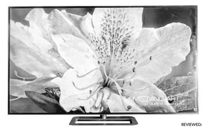
4K: 4K (or Ultra High Definition) is a new level of clarity and sharpness for TVs. 4K offers four times the resolution of regular HD TVs, roughly doubling the visible details in the picture. In 2015, many of the bigscreen TVs you can buy will be 4K TVs.