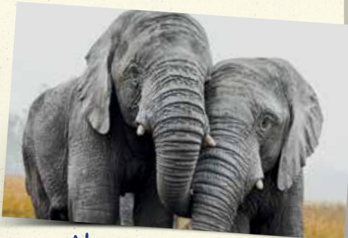
Nice new friends