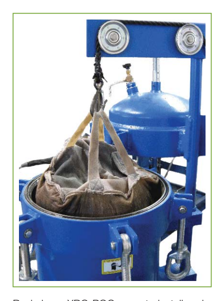
Resin bags XBG-PGG: easy to install and remove