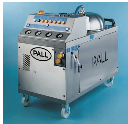
Pall HNP021 fluid purifier