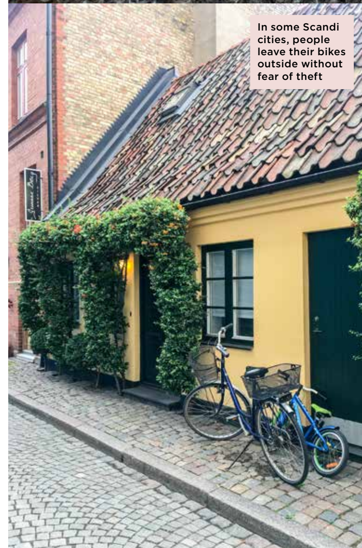
In some Scandi cities, people leave their bikes outside without fear of theft