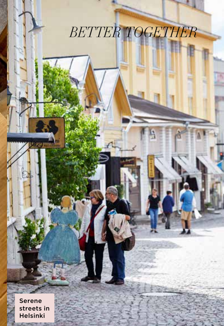
Serene streets in Helsinki