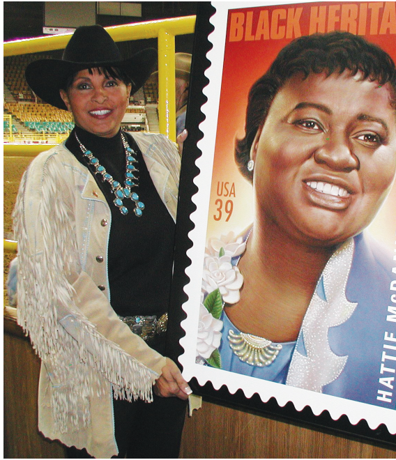
Pam Grier helped unveil the new Hattie McDaniel stamp at the Martin Luther King Jr. African American Heritage Rodeo of Champions at the National Western Stock Show.

"Kit is a straight woman who becomes involved with a person born a woman, but who later changed gender. Shocked by the revelation, Kit must decide whether to accept her lover for who they are, not what they are, because they want them in their life. Or does she cave in to what society deems is proper? It's really about the relationships, not the sex or the gender."