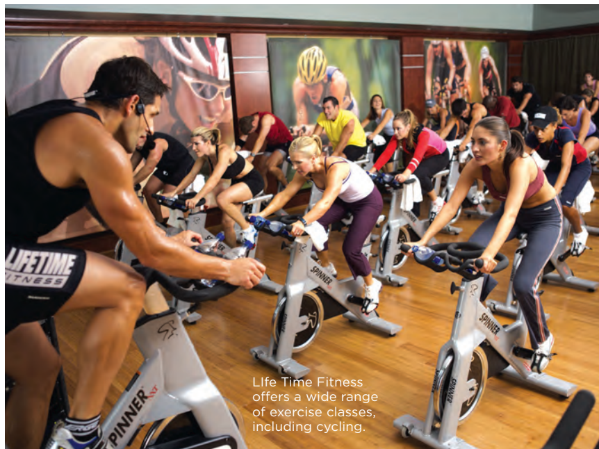
Life Time Fitness offers a wide range of exercise classes, including cycling.

12051 Elm Creek Blvd. • Maple Grove 763.416.2225 • www.biaggis.com