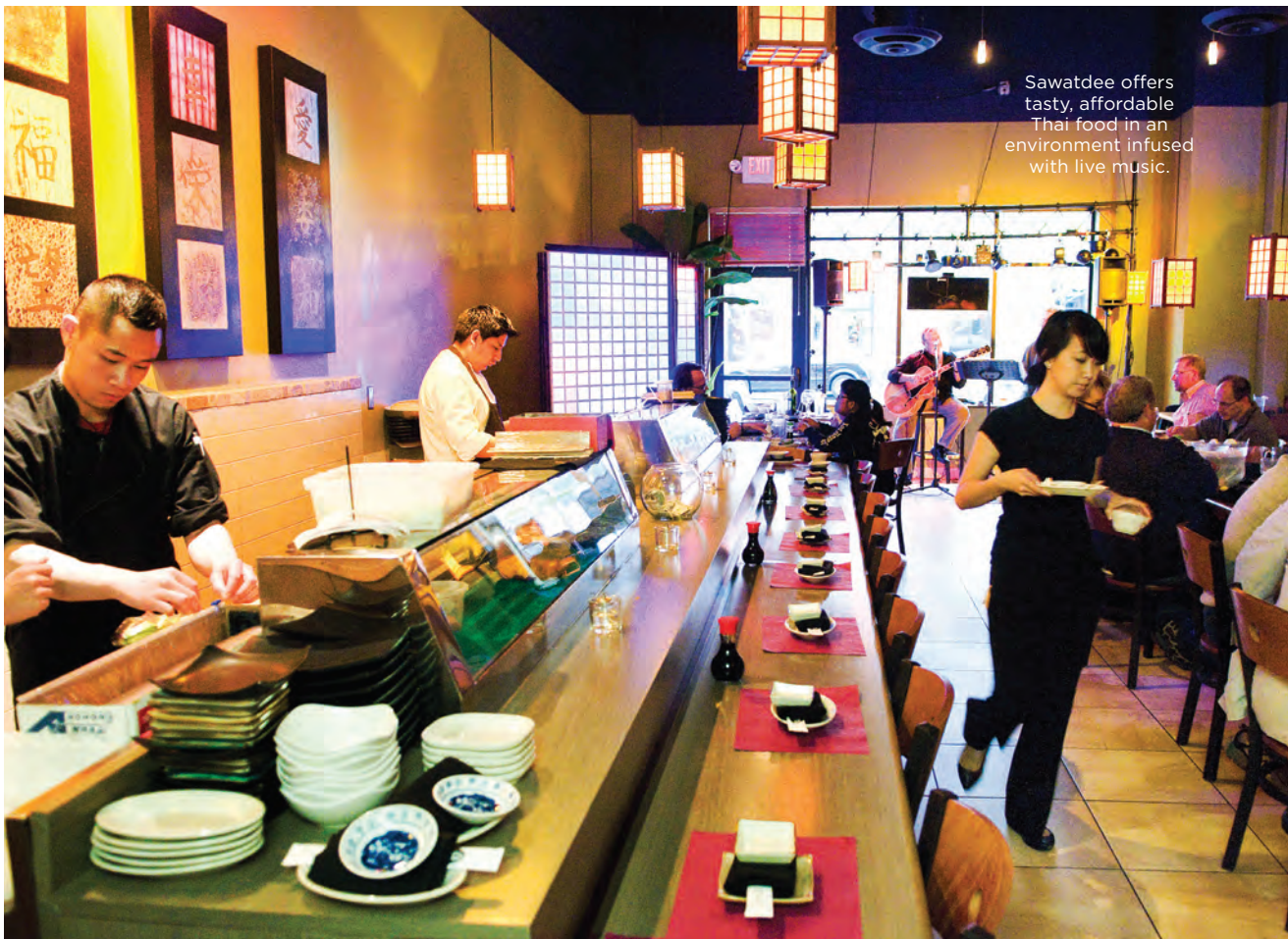
Sawatdee offers tasty, affordable Thai food in an environment infused with live music.