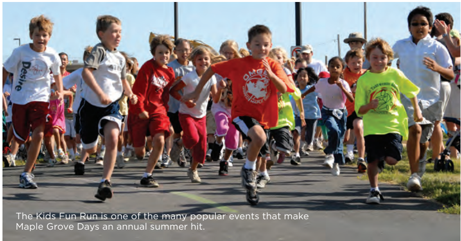
The Kids Fun Run is one of the many popular events that make Maple Grove Days an annual summer hit.

Again this year MarcDaniel Salon has won the battle of beauty. Whether it's carefully crafting the latest hair styles, applying the perfect makeup for the bride-to-be on her wedding day or pampering customers with the best manicures and pedicures in town, MarcDaniel's specialists will make you glow. MarcDaniel Salon, 7884 Main St., 763.416.0027 Red: Willow Salon White: Simonson's Salon & Day Spa