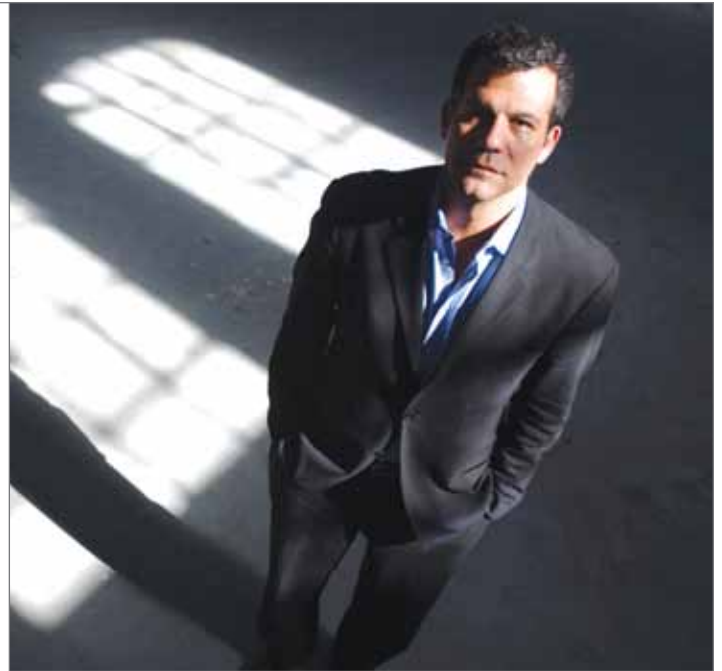
Richard Florida is one of the most sought-after public speakers in the world. Founder of The Creative Class Group, he is a regular contributor to CNN and senior editor for The Atlantic.