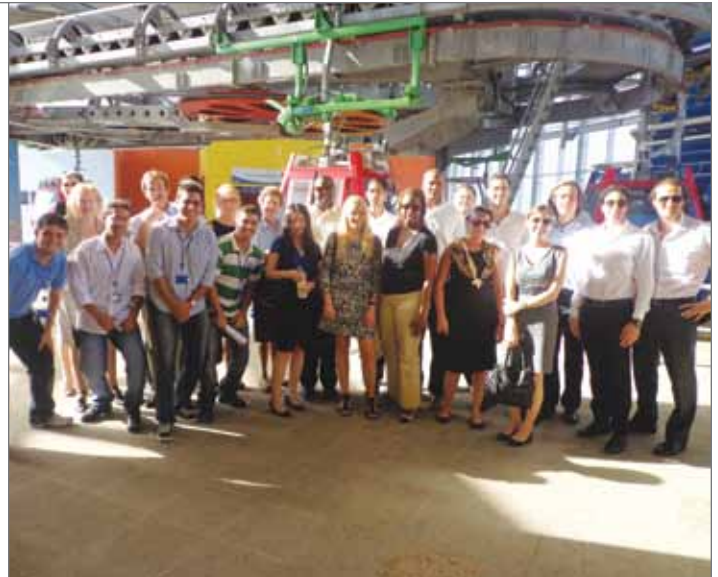
A group of NYU Schack students, faculty members, and administrators visit a public cable car/transport project connecting Rio favelas - with Odebrecht.