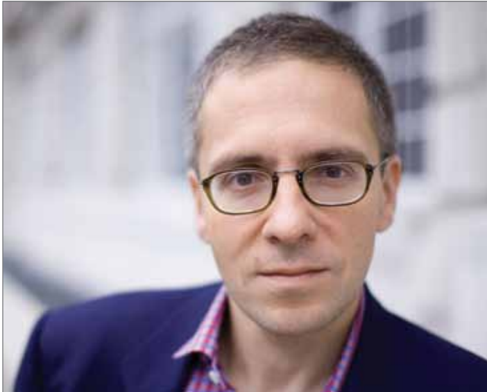
Ian Bremmer, president of Eurasia Group and expert on global macro political trends and emerging markets.