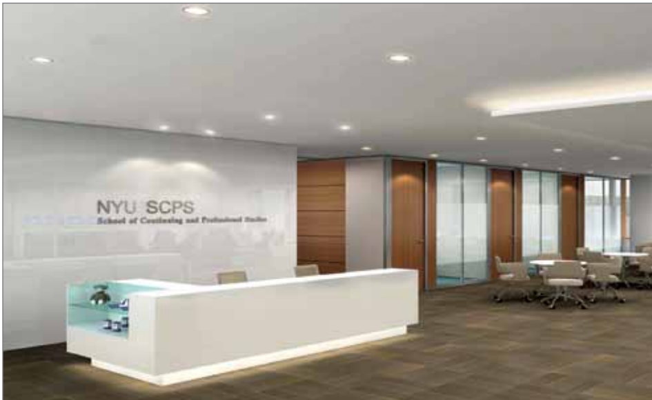
A rendering of the new NYU-SCPS ALI Tokyo Center, which will open this coming October.

NYU-SCPS and Nichii Gakkan Company entered into a collaboration and a service agreement to open the New York University School of Continuing and Professional Studies American Language Institute Tokyo Center (NYU-SCPS ALI Tokyo Center).