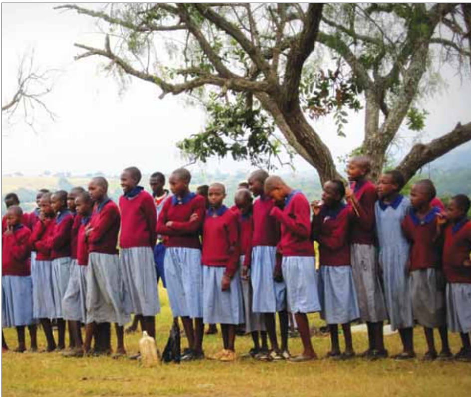
Maasai girls in their school uniforms in Kenya. Here, only 48 percent of girls enroll in school, and only 10 percent reach the high school level.

Through ongoing programs offered at an expanding number of global venues like Brazil Outreach, NYU Schack is uniquely equipped to provide its graduate students with the requisite knowledge and the skills to tackle the critical issues confronting the real estate and construction industries today, and moving forward. To learn more about NYU Schack's global initiatives, visit scps.nyu.edu/schack/globalinitiatives ♦