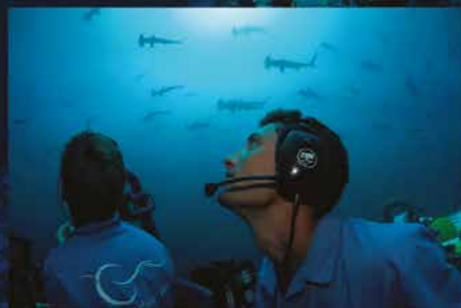
Exceptional Panoramic Views

One particularly notable trend in our jewellery division, Finlay Enterprises, is an almost 50% market share of the halo setting for diamond engagement rings.