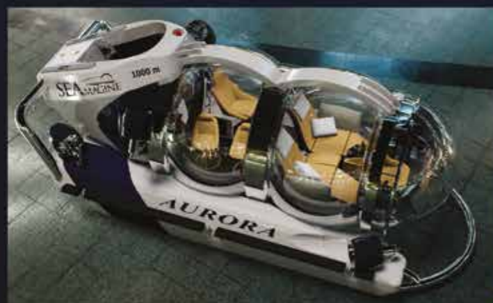
SEAmagine's 6 Person Luxury Model

2 to 6 Person Models 150 m to 1500 m Depth Ratings