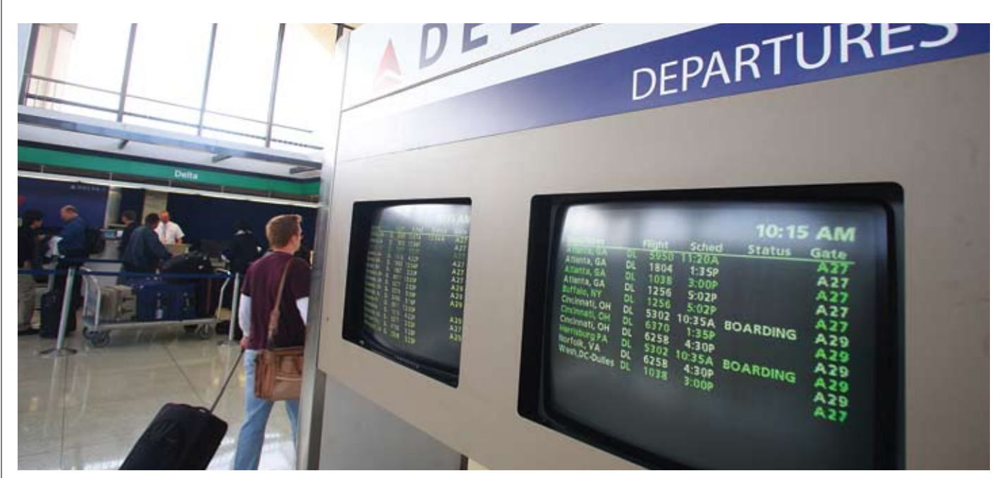
Delta Air Lines Inc. is now Memphis' hometown carrier following its merger with Northwest Airlines, and visitors to Memphis International Airport in the next few months will begin seeing Northwest signs replaced by Delta signs. How much will the merger affect air travel in the city? Delta executives have promised to keep Memphis a hub, but the overall economy could play a role in how many new flights – if any – the city receives.

Aviation analyst, Avondale Partners, Kansas City, Mo.