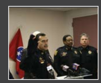
Busted Multiple dealers, weapons nabbed in drug war. Page 24

Navigating the Delta-Northwest Merger PAGE 16