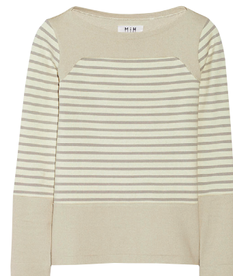
Breton Saddle Top , £115, by MiH Jeans ( mih-jeans.com )