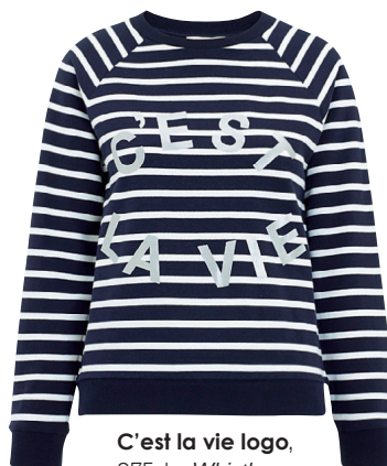
C'est la vie logo , £75, by Whistles ( whistles.co.uk )