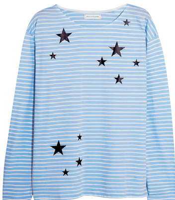
Star-print , £90, by Chinti and Parker , from net-a-porter.com