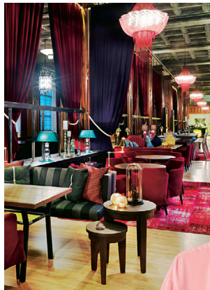
Clockwise from above Sunset over the canal; Hotel Flora; Da Matteo café; fashion from Weekday; the bar at Clarion Hotel Post