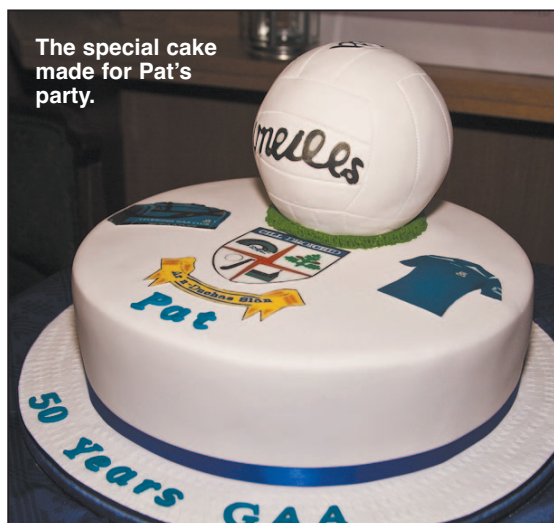
The special cake made for Pat's party.