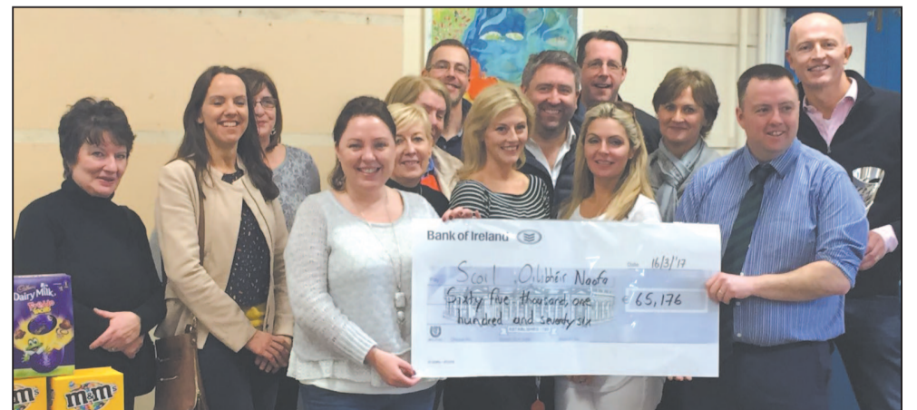
Staff, parents and past-pupils came together to organise a Strictly Come Dancing night at the Glenroyal in Maynooth which raised €65,176 for Scoil Oílibhéir Naofa in Kilcloon.