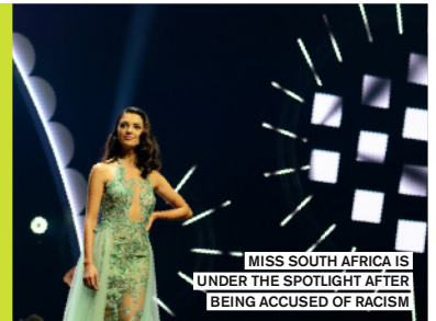
MISS SOUTH AFRICA IS UNDER THE SPOTLIGHT AFTER BEING ACCUSED OF RACISM