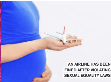
AN AIRLINE HAS BEEN FINED AFTER VIOLATING SEXUAL EQUALITY LAWS