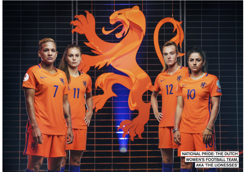
NATIONAL PRIDE: THE DUTCH WOMEN'S FOOTBALL TEAM, AKA 'THE LIONESSES'

Netherlands The Dutch royal crest has undergone a gender switch for the first time in 46 years, in celebration of women's sport. The new kit of the national women's football team will now sport a lioness instead of the traditional maned lion. The forward-thinking strip debuted last month during the opening stages of the women's UEFA Euros 2017 – which the country is hosting – and is part of a new initiative to drive female participation in sport. "This is so much bigger than just a campaign or logo update," said Hannah Smit, art director at W+K Amsterdam, who helped create the updated crest. "It's an idea that will continue to accelerate the growing momentum around women's football. It's a message that gives female players something of their own to rally behind." Goal scored.