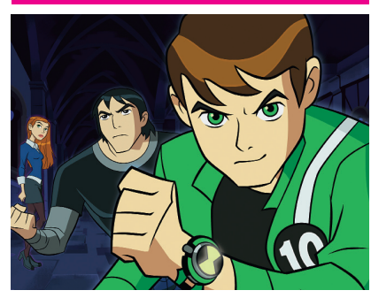
NEW EPISODE BEN 10 v JOHNNY TEST WEEKEND Sat 28, 9am, Cartoon Network (601) The boys vie to be your favourite hero! Join them all weekend as they battle ghosts, monsters and all things evil. To kick it off, there's a brand-new episode, Ben 10: Ultimate Alien.