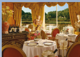
Clockwise from top: a double deluxe room at Parco dei Principi Grand Hotel & Spa; the outdoor pool; the main dining room; relaxation room. Below: Daniel Craig and co-star Monica Bellucci in Rome during a break from filming for Spectre