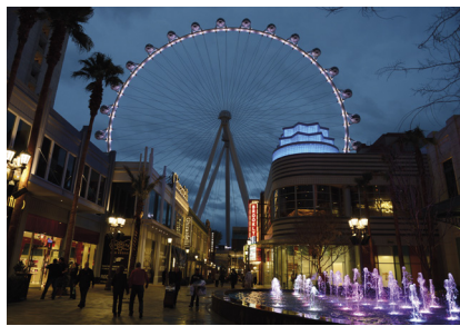
Wheel appeal: the High Roller in the Link entertainment district and, right, the Cromwell boutique hotel

Museum. It also features a neck-cranning new attraction in the High Roller – Vegas's observation wheel which, around 100ft taller than the London Eye, is the loftiest in the world. One of the 28 glass cabins can hold up to 40 people and during the 30-minute ride we enjoyed stunning views of the Strip including the famous fountains at the Bellagio.