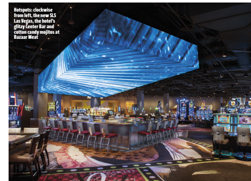
Hotspots: clockwise from left, the new SLS Las Vegas, the hotel's glitzy Center Bar and cotton candy mojitos at Bazaar Meat