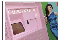
Fresh delivery: cupcake ATM at Sprinkles restaurant

dinner. With excellent service and a range of tapas-style meat samplings, guests can enjoy dishes such as foie gras candy floss (which must be eaten in one mouthful) and chicken-béchamel fritters served in a plastic shoe – washed down with cotton candy mojitos.