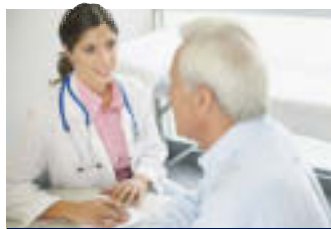
▶ 1,532 Bluecrest Clinics Nationwide

IN MOST CASES, there are no warning signs before a stroke. Yet, according to the World Health Organisation, 80% of strokes can be prevented. Your 'Health Report' includes tests that check your risk of stroke, heart, liver and kidney disease - often called 'silent killers' due to their lack of warning signs.