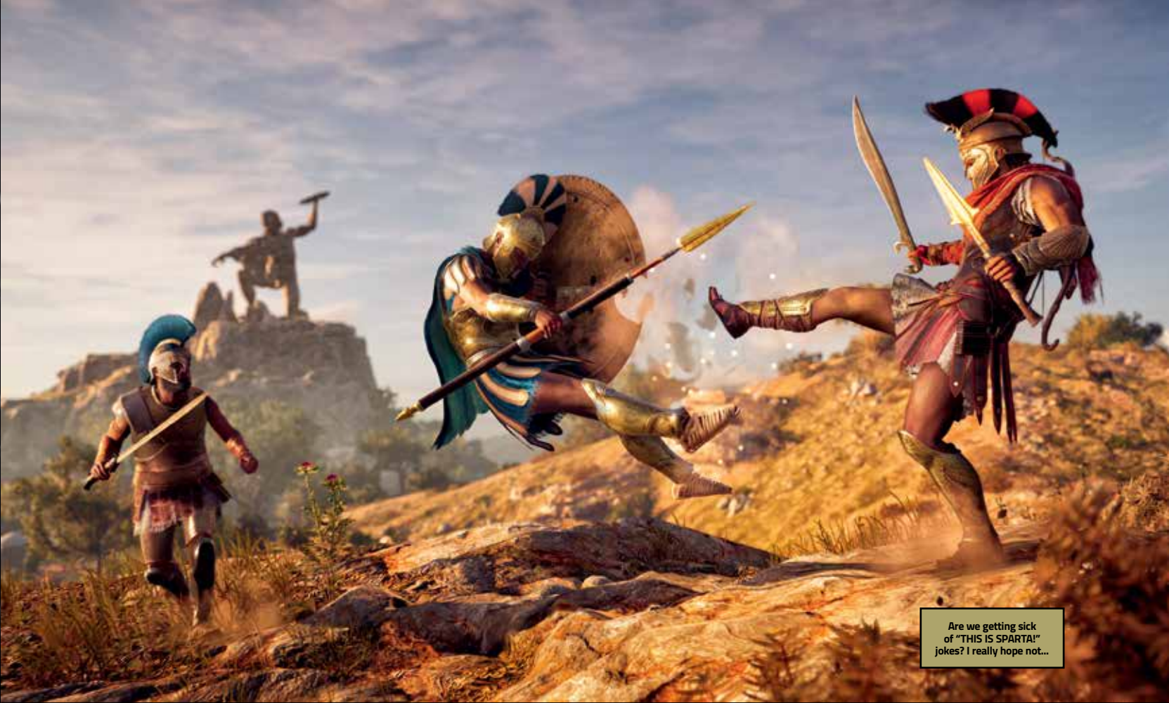
Are we getting sick of "THIS IS SPARTA!" jokes? I really hope not...