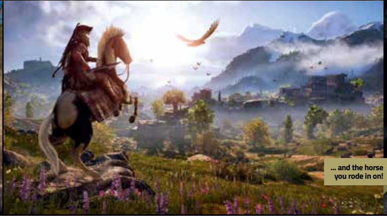
... and the horse you rode in on!