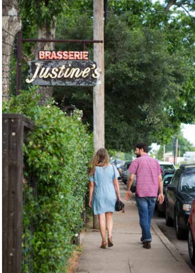
Bask in the glow of this east side brasserie's romantic ambiance.