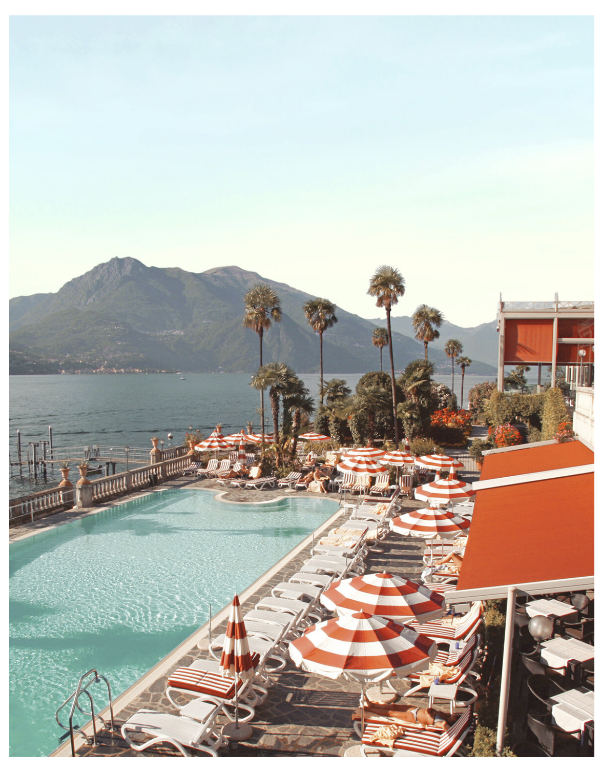
SCAL 1850 SCAL 1850