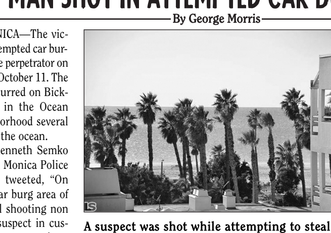
the shooter's car.

According to the Santa Monica Daily Press, the victim found the suspect in his car, which led to a confrontation and the victim threatened the suspect. The suspect attempted to flee, but was shot in the chest by the victim. Authorities arrived on the scene and located the suspect who at-