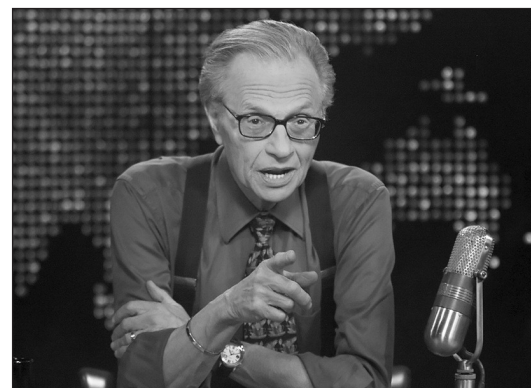
Talk show host Larry King was involved in a car accident in Beverly Hills.

The 83-year-old TV and radio show host was seen assessing the damage to both his Lincoln MK and the other driver's Mercedes-Benz after the crash, TMZ reported. Paramedics examined both King and the driver of the Mercedes. King and the other driver did not sustain any serious injuries from the crash. King and the other driver were not given citations by authorities.