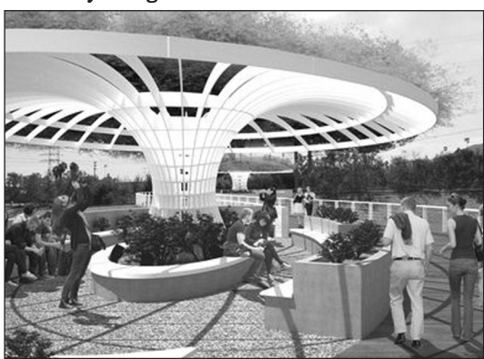
Proposed plans for the new, $20 million bridge connecting Griffith Park and Glendale was passed by the state assembly.

"We've worked for years to get this project off the ground. Thousands of residents on the Glendale side live in the shadow of Griffith Park with no way to get there without braving the freeway or driving for miles on city streets through Burbank or Los Angeles.