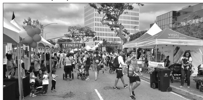
Participants during the "Kickin' Cancer" event on October 1.

The Lynn Cohen Foundation, dispersed at four clin-