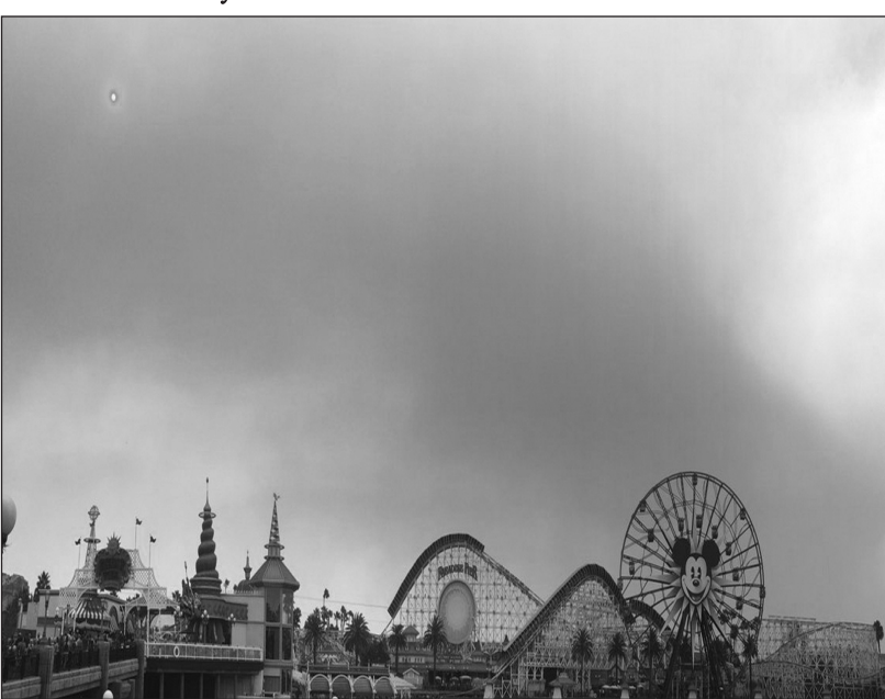
Anaheim Hills fire seen from Disneyland.

"The blaze was 25% contained as of Tuesday morning. Fire crews had managed to halt the blaze's westward progression, and were focusing on stopping its eastern advance beginning on Tuesday after-