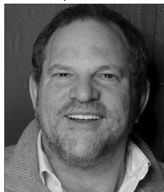
Harvey Weinstein has been the talk of the town as numerous reports have surfaced of his involvement in countless sexual harassment incidents.

Several of the victims came forward, but now their voices are just being heard. Its despicable behavior; it's sad and it's sickening and unbelievable that