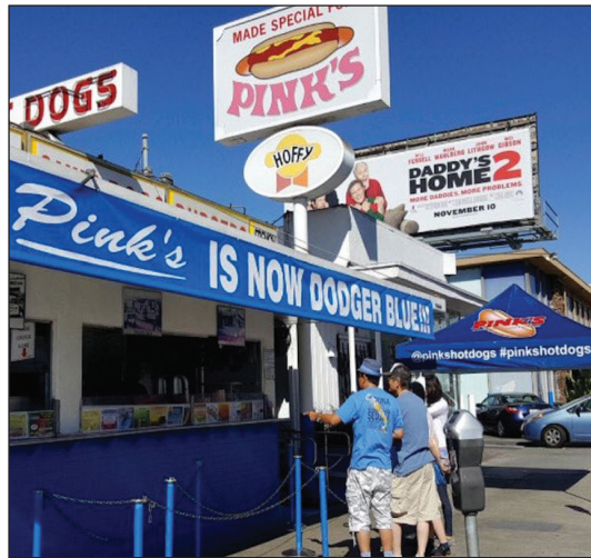
Pink's Hot Dogs is going blue to support the Los Angeles Dodgers in the 2017 World Series.