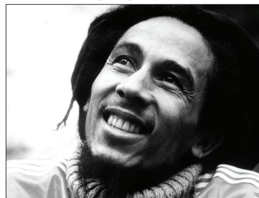
The Hollywood star of musician Bob Marley was vandalized on Monday, October 23.

Marley, the creator behind famous songs such as “One Love,” “Get Up, Stand Up,” and “Stir It Up,” was known for his contributions to Reggae and Ska. The Jamaican born musician formed the band “Bob Mar-