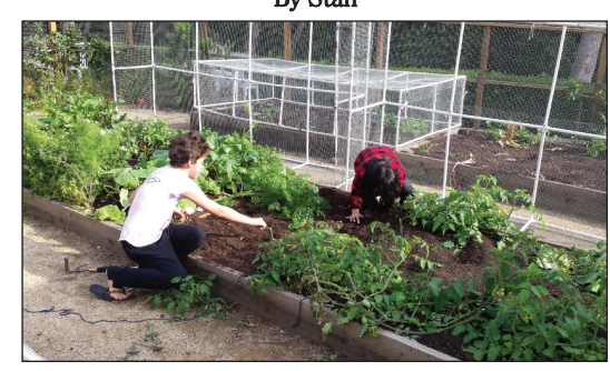
Two workshops to teach kids about the importance of gardening and how to start their own garden will be held on October 22 and October 29.

According to a press release Canvon News received from Dana Beesen, Publicist for the city of Beverly Hills, children can enroll in an individual workshop or both. The price for each workshop is $15 for residents of Beverly Hills and $19 for nonresidents.