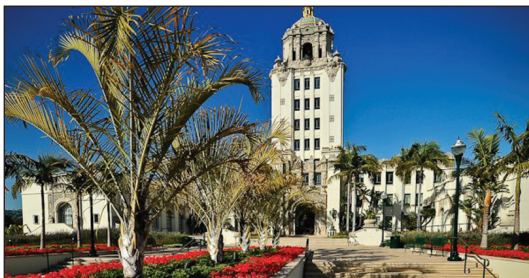
The city of Beverly Hills is sending out rental registry notices to tenants in Beverly Hills.

Council passed a rent stabilization ordinance earlier this year that halts rent increases to 3 percent per year, requires relocation fees for all tenants who are evicted without cause and establishes a rental unit registry