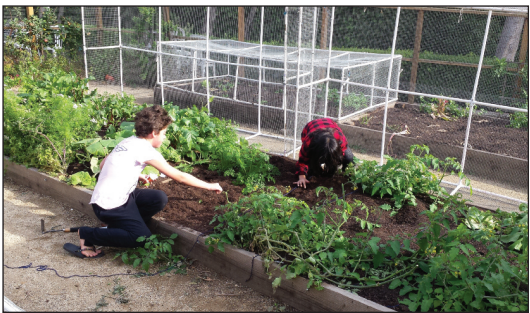
Two workshops to teach kids about the importance of gardening and how to start their own garden will be held on October 22 and October 29.

The gardening workshops offer kids an opportunity to interact and learn what it takes to grow fruits and vegetables and develop their own garden. The workshop