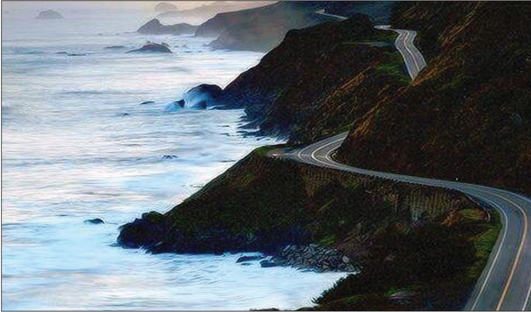
The Santa Monica Police Department are investigating a fatal collision involving a biker that occurred on the PCH on October 15.