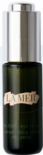
EYE LIFT IN A BOTTLE LA MER THE LIFTING EYE SERUM, P12,450, LA MER, RUSTAN'S THE BEAUTY SOURCE, RUSTAN'S MAKATI 1/L.

This precision serum supports the skin around the eye and brow area—giving a lifting effect—with its proprietary Stretch Matrix Complex coupled with sea botanicals that help promote the natural production of elastin. Added perk: The cool applicator stimulates microcirculation and soothes tired skin.