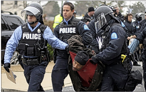
Hauled away: a protester being arrested outside St Louis city hall