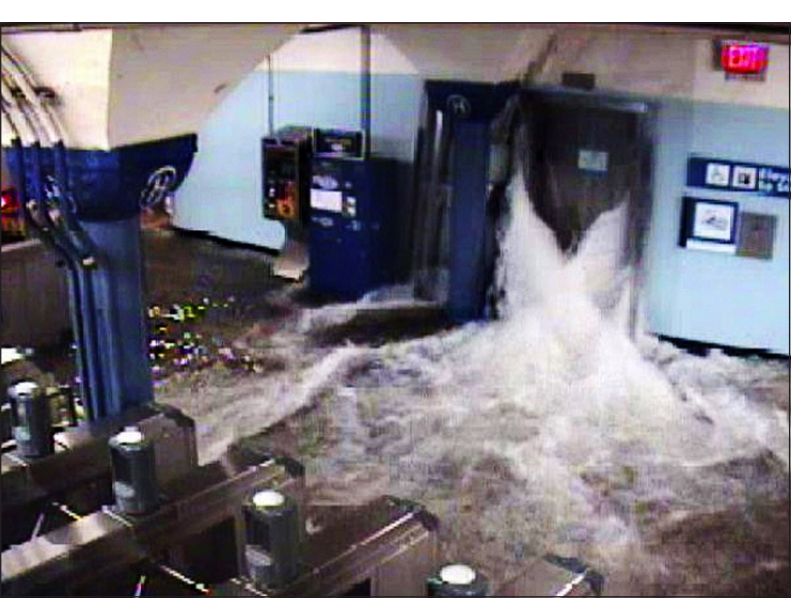
Carnage: water pours through New Jersey station, above, while a fire rages through Queens, below. Ground Zero, bottom, was also awash with storm waters

■ America's oldest nuclear power station in New Jersey was put on alert after rising flood waters threatened the cool-