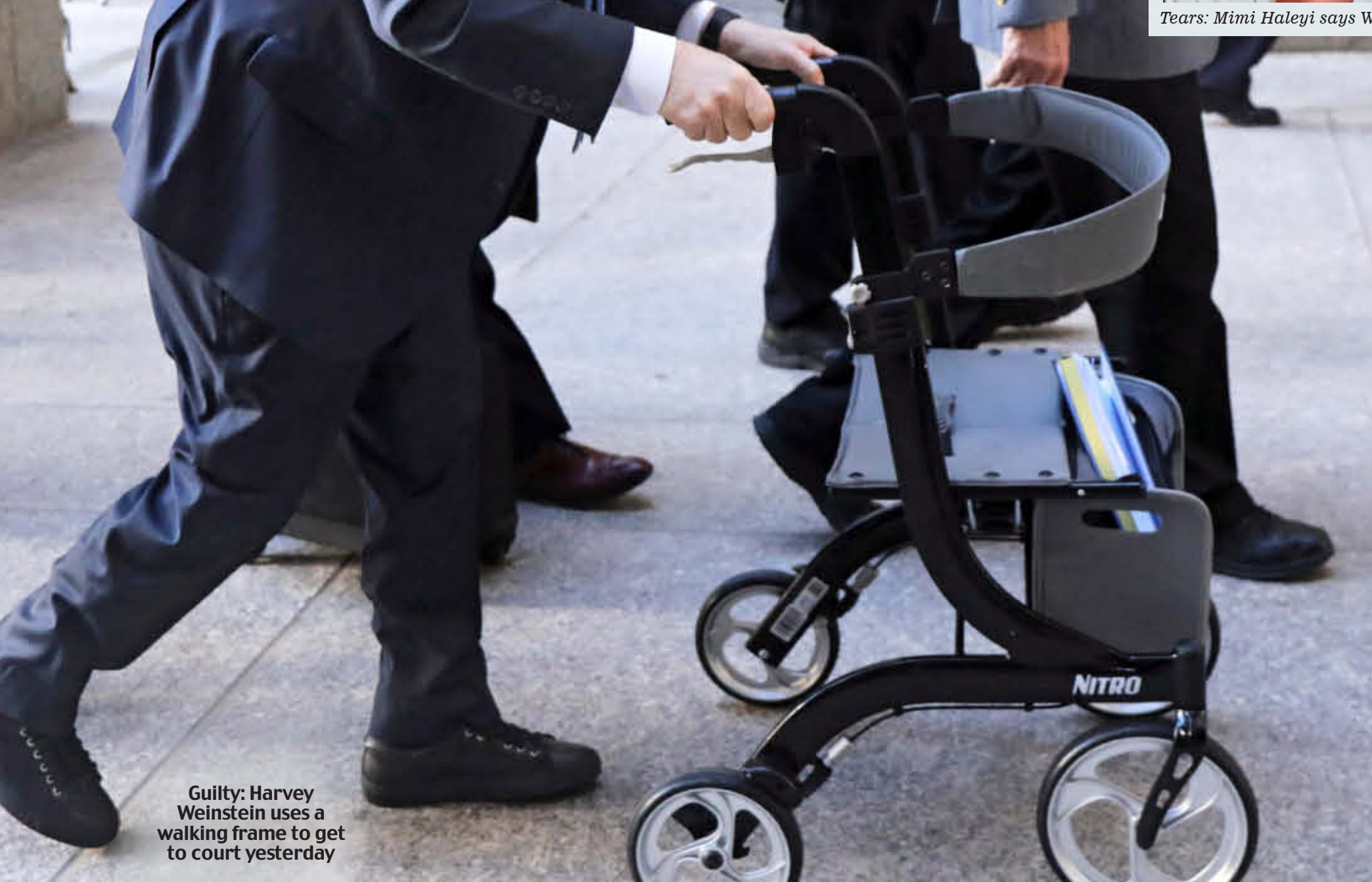
Guilty: Harvey Weinstein uses a walking frame to get to court yesterday

Tory former minister George Freeman said: 'Let us take this moment to send a clear message that this sort of behaviour will not be condoned or tolerated any more in this country.' Honours can be forfeited when a person is considered to have brought the system into disrepute. A recommendation is made by the Honours and Appointments Secretariat to the Forfeiture Committee – made up of senior civil servants. The final decision must be approved by the Queen. Weinstein has already been kicked out of industry bodies including the Academy of Motion Picture Arts and Sciences, which runs the Oscars, and the British Academy of Film and Television Arts, which organises the Baftas.