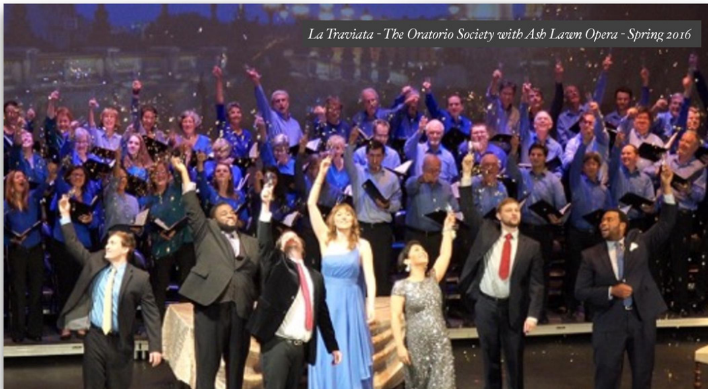
La Traviata - The Oratorio Society with Ash Lawn Opera - Spring 2016

We invite you to join our pursuit of excellence in the next chapters of our amazing story!