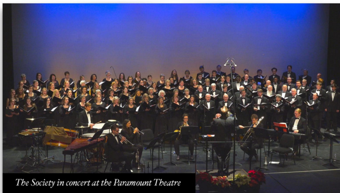
The Society in concert at the Paramount Theatre