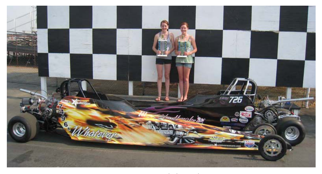
Jr. Dragsters and their drivers