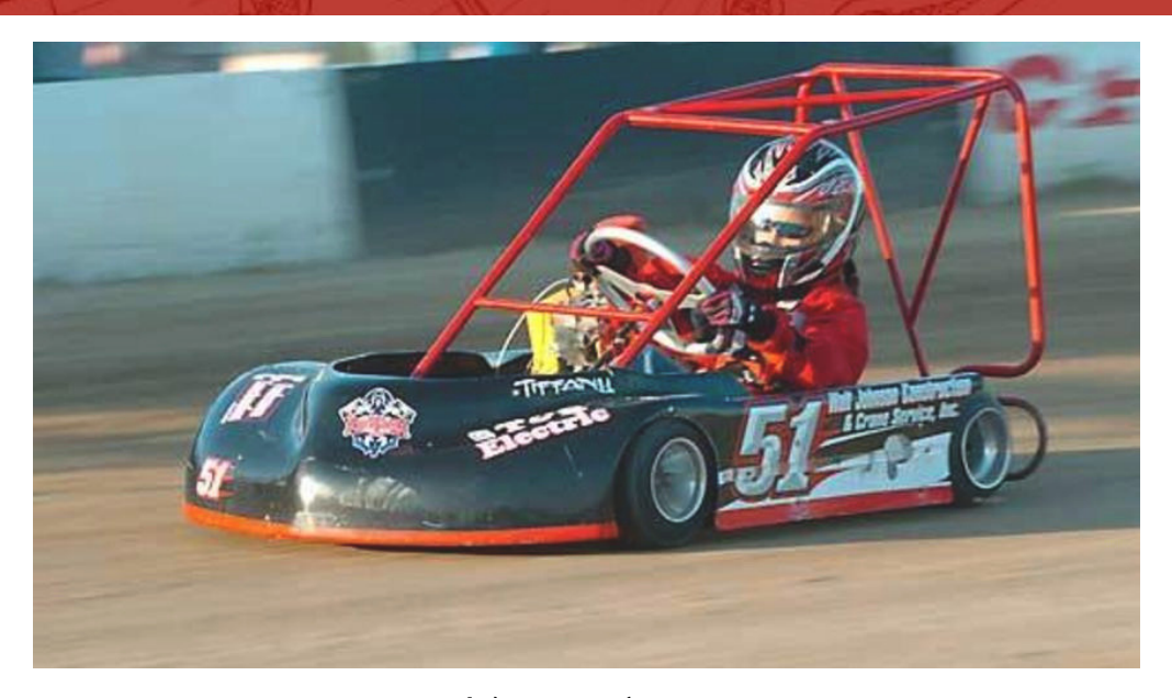
A Caged (Junior) Kart in action