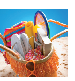
VOICE YOUR CHOICE

This week's poll: The summer season is upon us. How do you plan to spend your days?