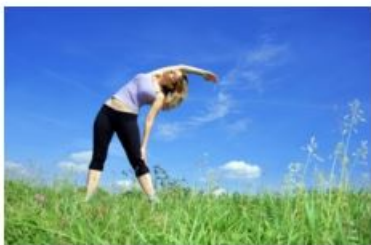
Nature As Your Own Gym...