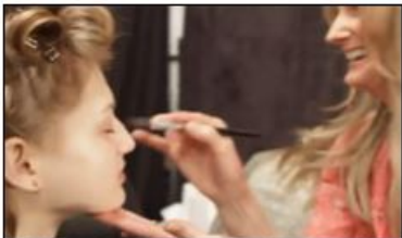
Fashion Week Flashback: Best Beauty Tips for Fall/Winter 2011