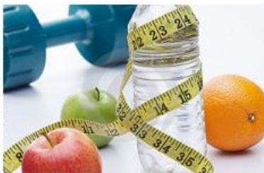
Ten Simple Things You Can Do Every ...