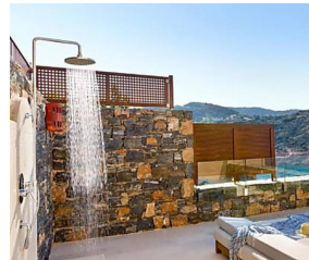
Sponsored- The Telegraph - Tr... All-inclusive holiday in Greece, anyone?