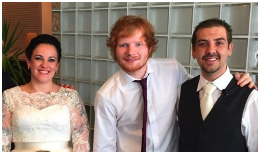
Ed Sheeran is the king of weddings.

Following the news that one in seven couples in the UK choose an Ed Sheeran song for their big day first dance (srsly) we decided to pick out some of our fave Ed tunes – perfect for every moment of your wedding.