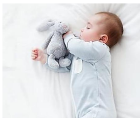
Sponsored- MORI Help Your Baby Sleep With These Warm, Cosy Sleep...