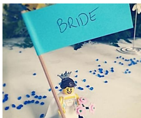
Plan Your Perfect Wedding 23 unique wedding place setting ideas