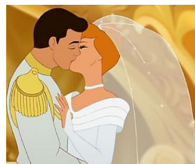
Plan Your Perfect Wedding 17 Disney love quotes to make you swoon!