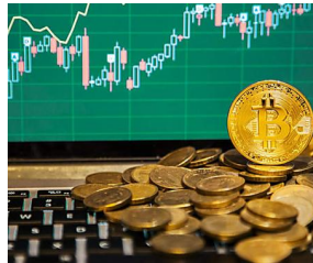
Sponsored- 24busreportuk Bitcoin Price Smashes $7000 and Rising! No Sign...