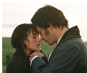
Plan Your Perfect Wedding 12 romantic wedding readings from books