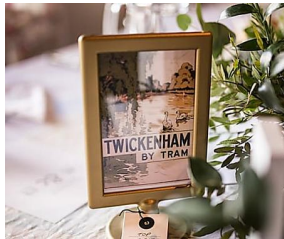
Plan Your Perfect Wedding 10 IKEA wedding décor hacks