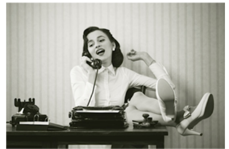
TOOLS, TIPS AND MORE ▶