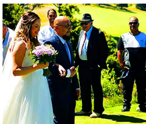
Sponsored- Scribol [Gallery] Hours After This Woman Said Her Wedding...