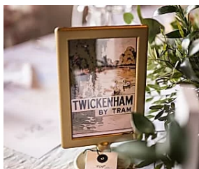
Plan Your Perfect Wedding 10 IKEA wedding décor hacks