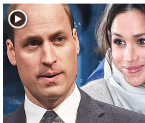
Sponsored- The Express Meghan Markle news: Is Prince William 'furious'...