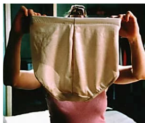
Plan Your Perfect Wedding Bride-to-be blog: The Bridget Jones dilemma