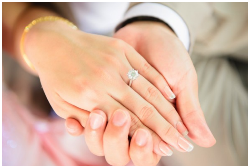
You need to care for your engagement ring.