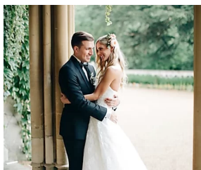
Plan Your Perfect Wedding The 4 week wedding countdown