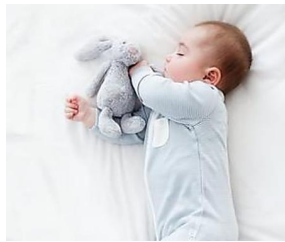
Sponsored- MORI Help Your Baby Sleep With These Warm, Cosy Sleep...

How many wedding dresses did you try on before you found 'the one'? Recommended by