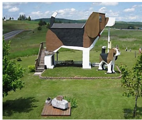
Sponsored- The Telegraph - Tr... The 50 greatest hotels in the world