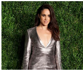
Plan Your Perfect Wedding We predict Meghan Markle's wedding dress style