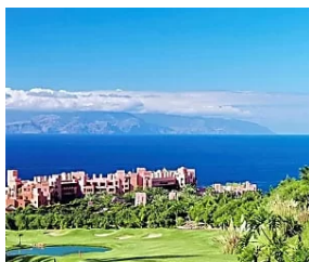
Sponsored- The Telegraph - Tr... Why Tenerife is the star of the Canary Islands