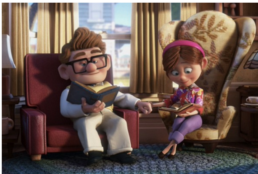
Rules for long-term couples.

There are a few rules that everyone in a long-term relationship comes to know, from sleep routines to household chores – don't worry marriage won't change any of them!