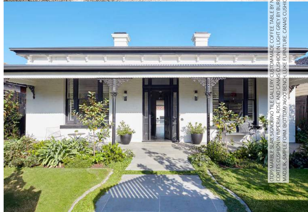
(TOP) MARBLE SLAB, SIGNORINO TILE GALLERY; CUSTOM-MADE COFFEE TABLE BY NICK McDONALD AT MADE BY MORGEN; FIVE OTTOMAN IN LIGHT GREY, LUKE FURNITURE; CORTES CUSHION IN IMPERIAL ROSE AND CANAIS CUSHION IN LIGHT GREY BY BUREL MOUNTAINS FOR FIGGSCOPE-CURATES; ARTWORK: NOTHING INTO NOTHING BY BENJAMIN MADLIK; SIMPLE FORM. (BOTTOM) AGOC BENCH, LUKE FURNITURE; CANAIS CUSHION IN MEDIUM GREY BY BUREL MOUNTAINS FOR FIGGSCOPE-CURATES