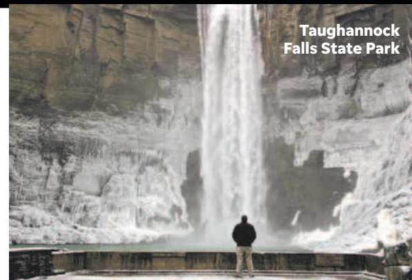
Taughannock Falls State Park