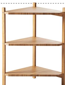
'Ragrund' bamboo corner shelf, $29.99/340mm x 600mm, Ikea.

This minimalist integrated mirror and shelf has a vanity unit to match.