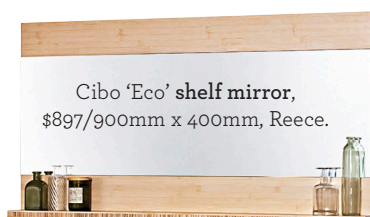
Cibo 'Eco' shelf mirror, $897/900mm x 400mm, Reece.

This minimalist integrated mirror and shelf has a vanity unit to match.