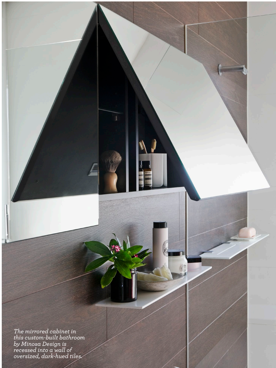
The mirrored cabinet in this custom-built bathroom by Minosa Design is recessed into a wall of oversized, dark-hued tiles.