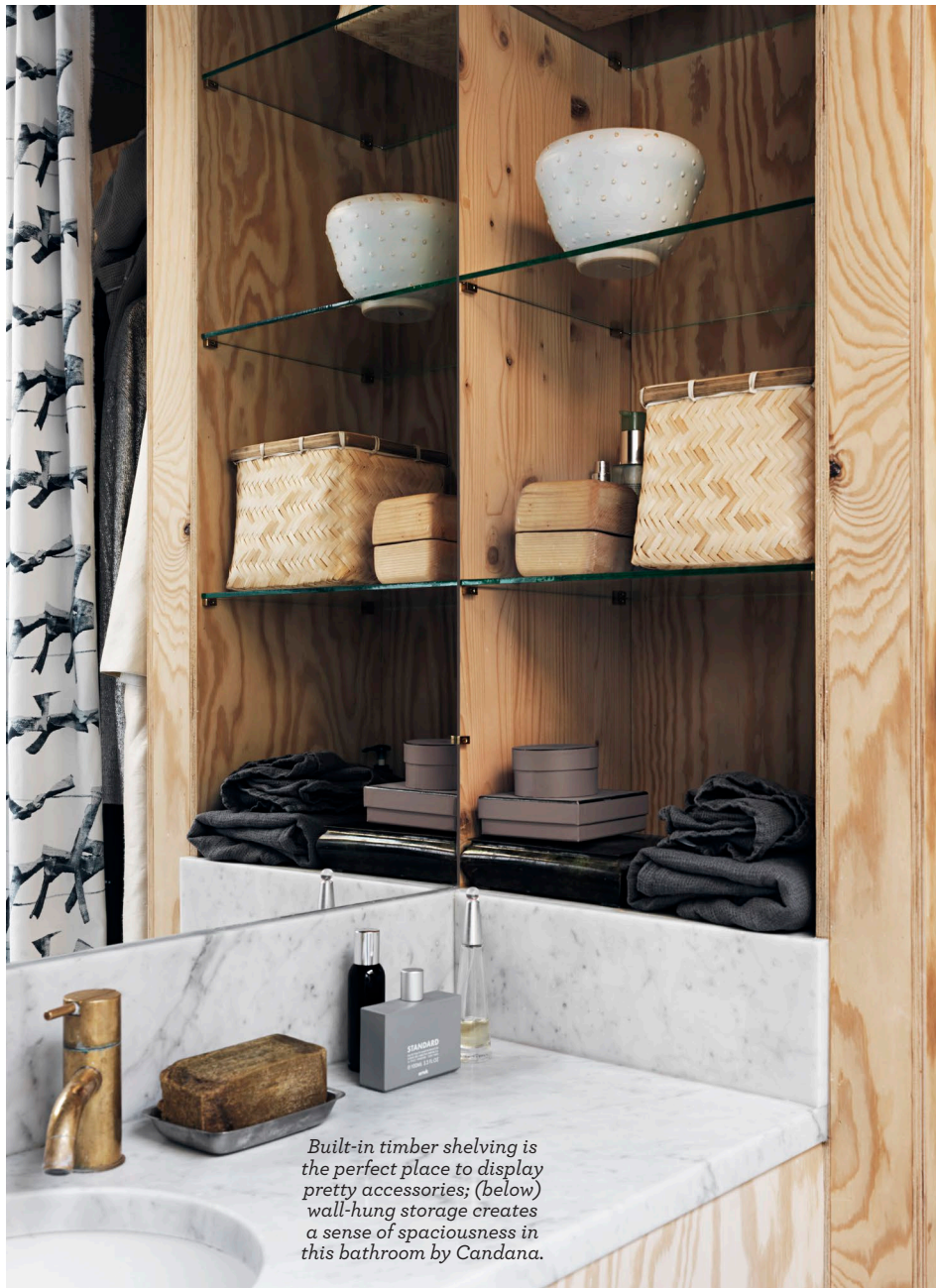
Built-in timber shelving is the perfect place to display pretty accessories; (below) wall-hung storage creates a sense of spaciousness in this bathroom by Candana.