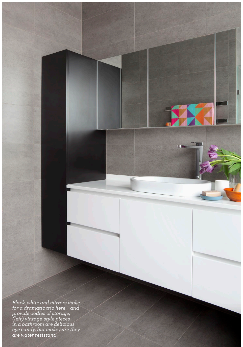
Black, white and mirrors make for a dramatic trio here – and provide oodles of storage; (left) vintage-style pieces in a bathroom are delicious eye candy, but make sure they are water resistant.

“Built-in cupboards behind mirrors are being employed more than ever... they are the workhorses of bathroom storage” ~ Melissa Bonney, The Design Hunter