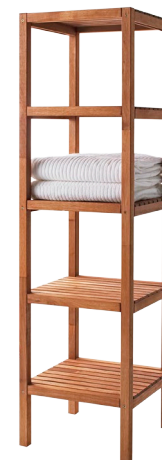
‘Molger’ shelving unit, $89/370mm x 1400mm, Ikea.

Sturdy slatted timber gives this open shelf unit a Scandi look.