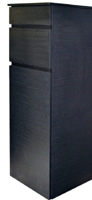
Kado ‘Aspect’ wall-hung tall boy, $1221/400mm x 1000mm, Reece.

In high-shine polyurethane, this sleek unit comes with adjustable glass shelves.