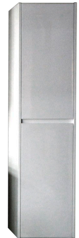
‘Como’ side storage, $899/330mm x 1200mm, Parisi.

This wall-fixed piece comes in six colourways. The door can be right or left opening.