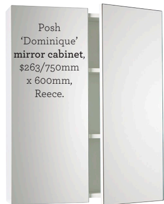
Posh 'Dominique' mirror cabinet, $263/750mm x 600mm, Reece.

The timber-look surround adds warmth; features include adjustable shelving, soft-close and finger-pull opening.