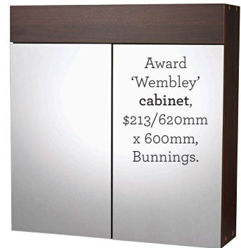
Award 'Wembley' cabinet, $213/620mm x 600mm, Bunnings.

The timber-look surround adds warmth; features include adjustable shelving, soft-close and finger-pull opening.