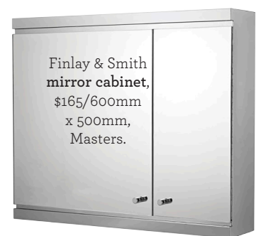
Finlay & Smith mirror cabinet, $165/600mm x 500mm, Masters.

The wood-grain-backed glass shelving adds interest to this vanity.