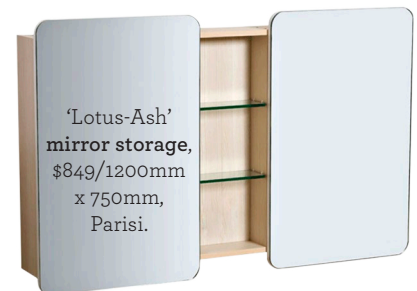
'Lotus-Ash' mirror storage, $849/1200mm x 750mm, Parisi.

This simple, streamlined, two-door cabinet in white polyurethane has adjustable shelves.